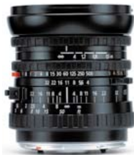
CFi 4/50 mm